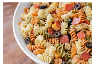
Pasta Salad with Italian Dressing