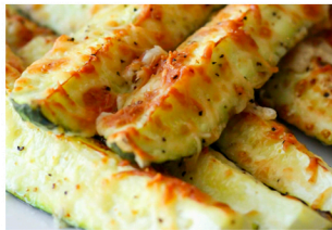
Parmesan Crusted Zucchini