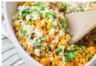
Mexican Street Corn Recipe