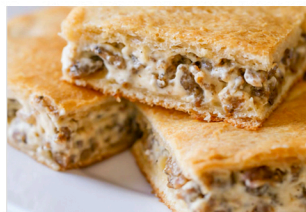
Sausage Cream Cheese Casserole