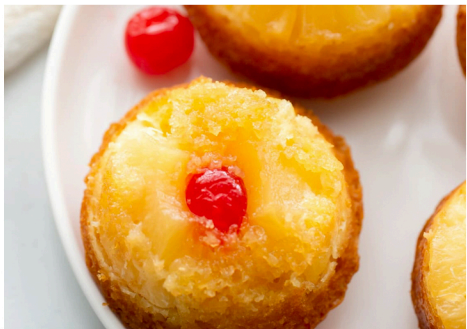
Pineapple Upside Down Cupcakes