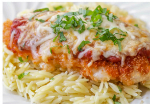
Baked Chicken Parmesan