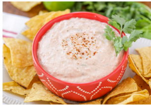
Cream Cheese Salsa Dip