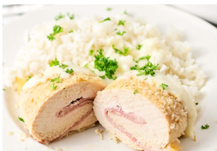
Easy Chicken Cordon Bleu