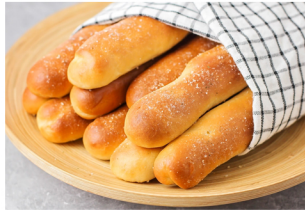
Olive Garden Breadsticks