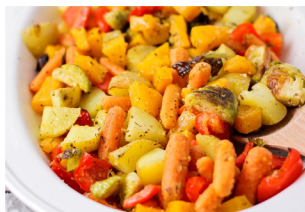
Oven Roasted Vegetables