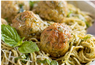
Chicken Pesto Meatballs