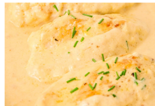
Buttery Baked Chicken Recipe